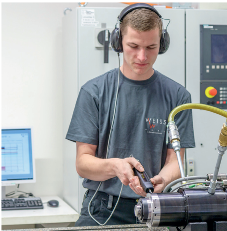
The acceptance test includes a review of the standard and of the essential criteria for customer use