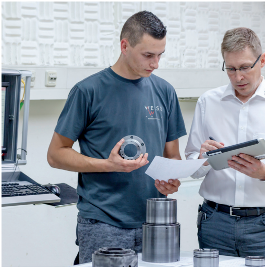
The damage report provides our customers with valuable details and a list of required new parts and labor