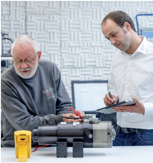
Thorough initial inspection forms the basis for all corrective maintenance

Worldwide spindle service - on fair terms