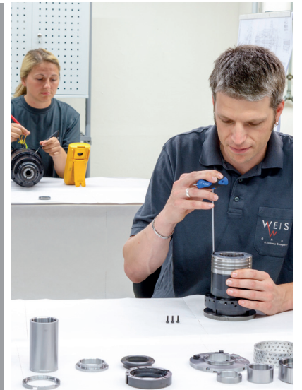
Spindle assembly requires great care and much experience