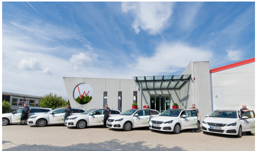
WEISS spindle service on site - not just locally, but worldwide: quick help for optimal operation