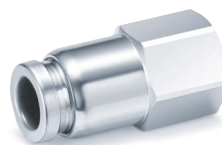
304 stainless steel and electroless nickel plated brass ⊕ KQB2-F Series