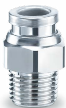
Specialty fitting, 316 stainless steel, male connector ⊕ KFG2H Series