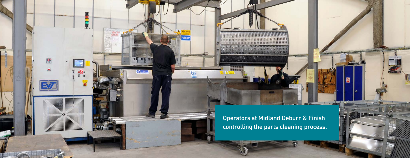
Operators at Midland Deburr & Finish controlling the parts cleaning process.