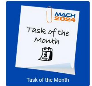
Task of the Month