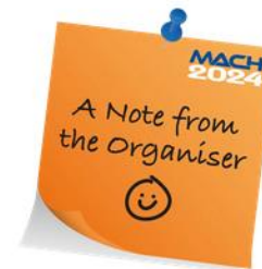
A Note from the Organiser